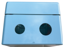
Holes for conduit connections

Box can be supplied in any of the three configurations below: