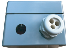
Supplied with cord grip for sensor and valve wire