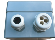
Cord grips for power, sensor and valve wiring